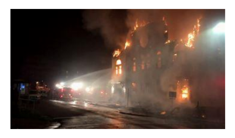
A fire at a Jewish synagogue in Duluth, Minn., on Sept. 9, 2019.